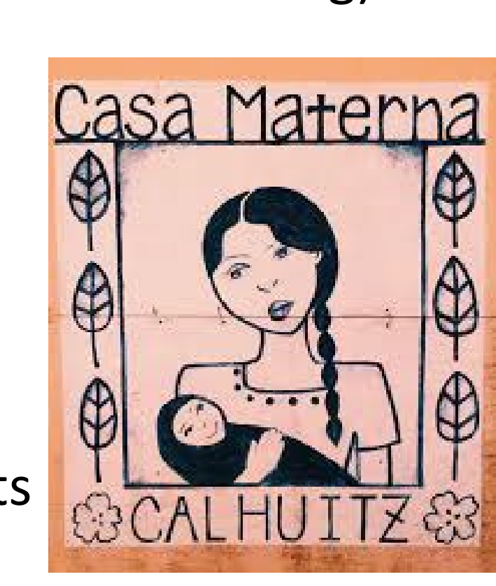
was built in the town of Calhuitz by Curamericas-Guatemala and the community (2009).

• The Birthing Centers are based on CBIO principles of community engagement and community partnership. They resemble traditional Maya homes and each is staffed by Maya speaking health professionals who were trained and supervised by an obstetric nurse in Calhuitz (figure 4). Traditional birthing attendants (Comodronas) were integrated, leading the Guatemalan government to include them through a "harm reduction" strategy. Services were free of charge.