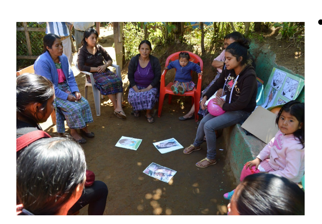
Figure 3. A Promoter leads a Care Group, training mothers to be peer educators.

established after mapping all households. Each comprised of 5–12 Care Group Volunteers who were each responsible for 10–15 households. Their detection of vital events established a community-based vital events surveillance system <u>as part of CBIO</u> and led