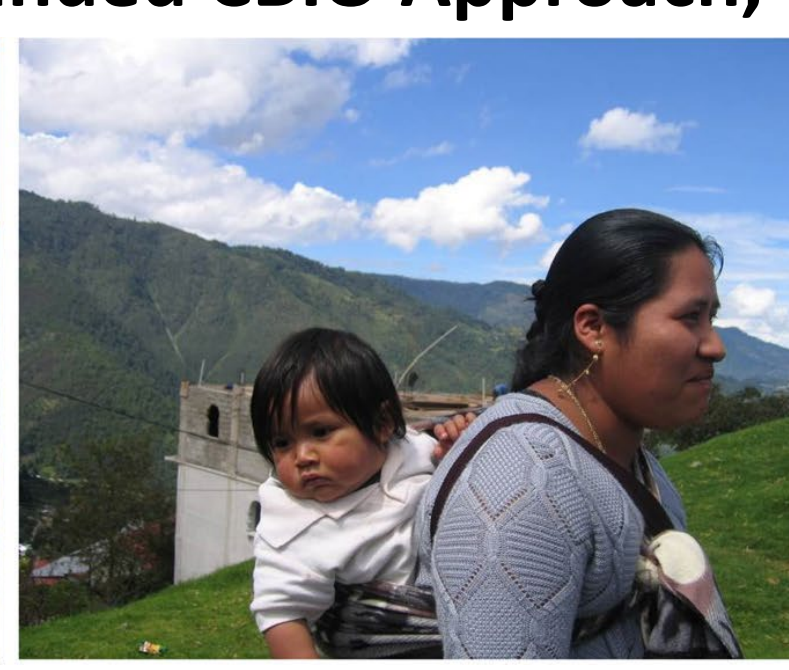
Figure 1. Typical view of project area (left) and mother and child living in project area (right).